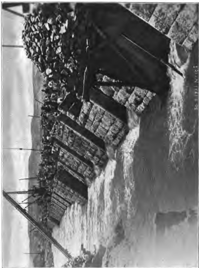
ASSOUAN BARRAGE, LOWER LEVEL SLUICES WITH NILE RUNNING THROUGH.